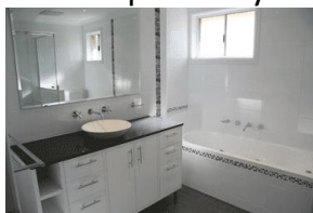
yù shì 浴室

Label the parts in your home that you have learned so far.