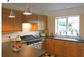
chú fáng 厨房