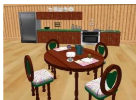
fàn tīng 饭厅